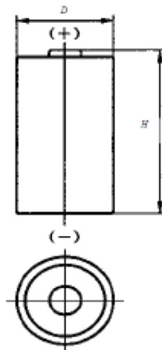
Figure 1- Jacketed cylindrical cells

Designation: NCTC2500 (26/49) (C) (D:25.8 0 -1.0 mm H:50.0 0 -2.0 mm)